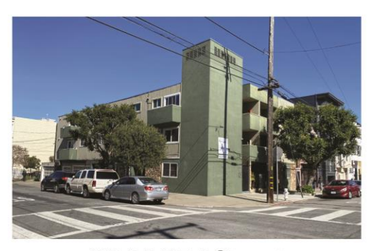
2844 21<sup>st</sup> Street $3,595,000 | 12 Units