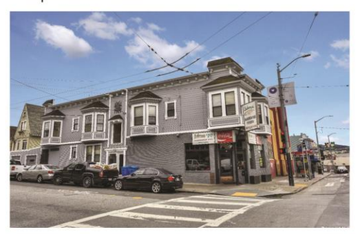
3801 Mission Street