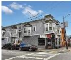
3801 Mission Street $1,900,000 4 Unit Mixed-Use