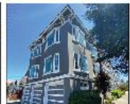
302 28 th Avenue $3,275,000 6 Units Multifamily