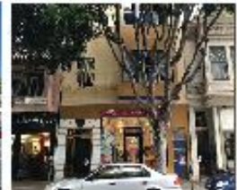
3156-3158 24 th Street $2,700,000 8 Unit Mixed-Use