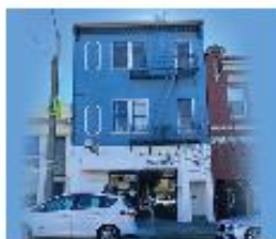
627-633 Irving Street $3,000,000 3 Unit Mixed-Use