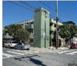
2844 21 st Street $3,595,000 12 Units