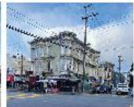
2697 Mission Street $4,700,000 28 Units Mixed-Use