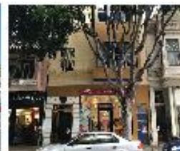
3156-3158 24 th Street $2,700,000 8 Unit Mixed-Use