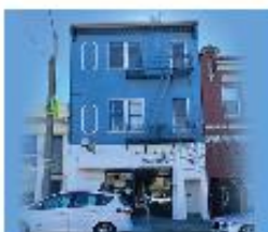
627-633 Irving Street $3,000,000 3 Unit Mixed-Use