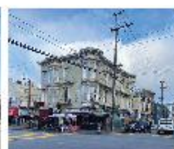
2697 Mission Street $4,700,000 28 Units Mixed-Use