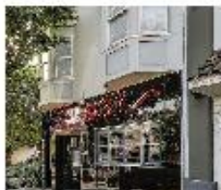
249 Grand Avenue $1,887,500 2 Unit Mixed-Use