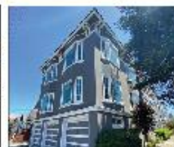
302 28 th Avenue $3,275,000 6 Units Multifamily