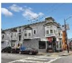
3801 Mission Street $1,900,000 4 Unit Mixed-Use