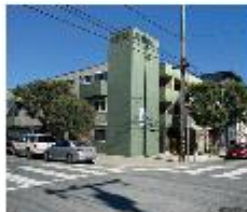
2844 21 st Street $3,595,000 12 Units