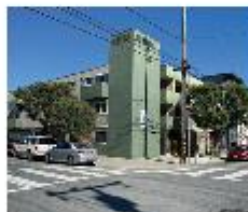
2844 21 st Street $3,595,000 12 Units