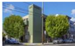
2844 21st St, San Francisco 12 Units