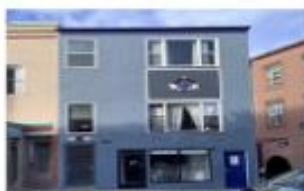
3134 24th St, San Francisco