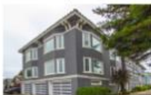
302 28th Ave, San Francisco