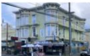
2697 Mission St, San Francisco