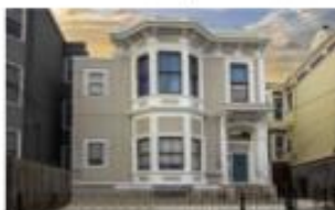
868 Shotwell St, San Francisco