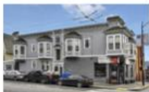
3801 Mission St, San Francisco