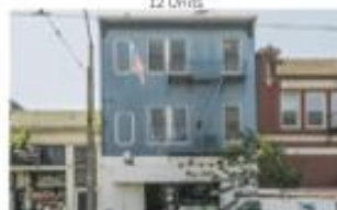
627-633 Irving St, San Francisco