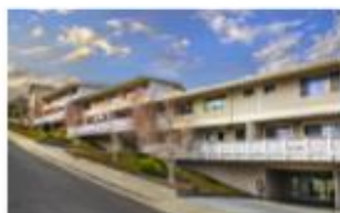
2760 Melendy Dr, San Carlos