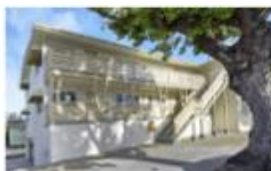
200 Chadbourne Ave, Millbrae