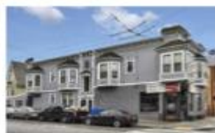
3801 Mission St, San Francisco