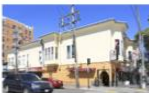
2884 Mission St, San Francisco