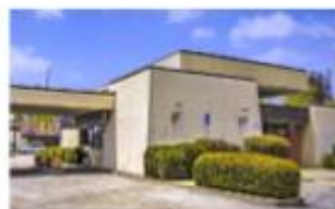
15350 E 14th St, San Leandro