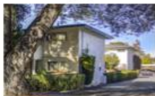
184 Centre St, Mountain View