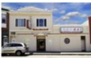
2239-2245 Judah St, San Francisco