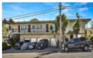
280 San Felipe Ave, San Bruno