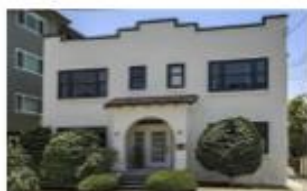
160 Athol Ave, Oakland