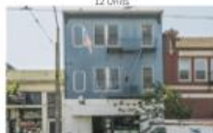
627-633 Irving St, San Francisco