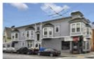
3801 Mission St, San Francisco